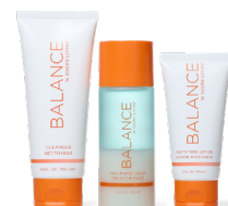
BALANCE by Young Living™ Collection Item No.: 42118